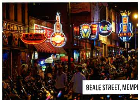
BEALE STREET, MEMPHIS