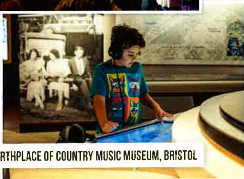
BIRTHPLACE OF COUNTRY MUSIC MUSEUM, BRISTOL