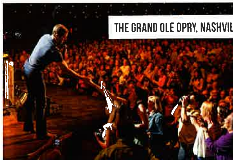
THE GRAND OLE OPRY, NASHVILLE