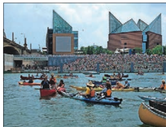
Kayaking on the downtown riverfront.

Put on your walking shoes and visit Ruby Falls, an underground waterfall, and Rock City Gardens. From the See Seven States Overlook, admire breathtaking views of parts of Tennessee, Alabama, Georgia, South Carolina, North Carolina, Virginia and Kentucky.