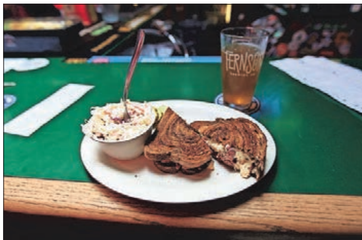
A Blackstone Reuben sandwich is served at the Crescent Moon Tavern, Omaha, Nebraska.