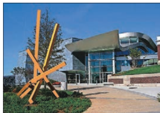
Hunter Museum of Art.

Save time to visit the enlightening Hunter Museum of American Art, which is built on a 90-foot limestone bluff overlooking the Tennessee River and showcases 100 years of architecture and one of the finest collections of American art in the Southeast. The impressive Tennessee Aquarium invites you to discover penguins, sharks, alligators, otters and more. There is also a butterfly garden there. Grab a cup of coffee and meander through the Bluff View Art District.