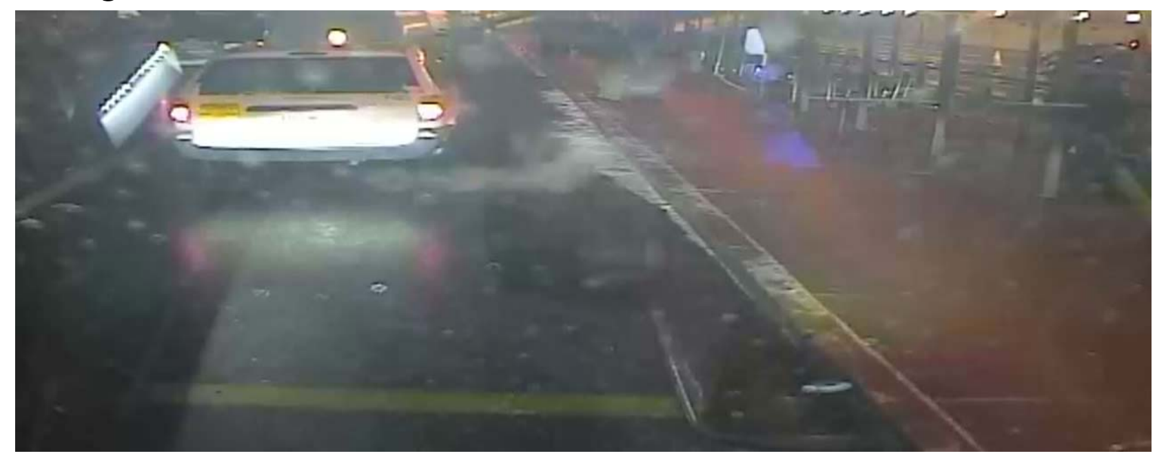
This accident was preventable!

• A hotel courtesy shuttle discharges passengers from a through lane.