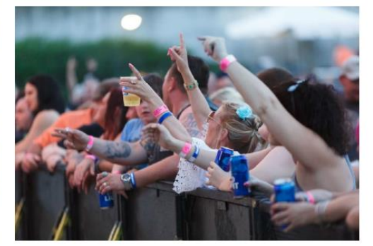
Concert goers enjoying the show at Fayetteville Dogwood Festival