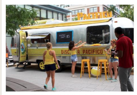
Pacifico Beer trailer coming to Dogwood

Tip: Both Lake Gaston Brewing Company and Huske will have some of the best views of the Dogwood Festival in all of downtown. Pop into either brewery during the fest to try one of their signature craft beers and grab a seat on their patio for a bird's eye view of the festivities.