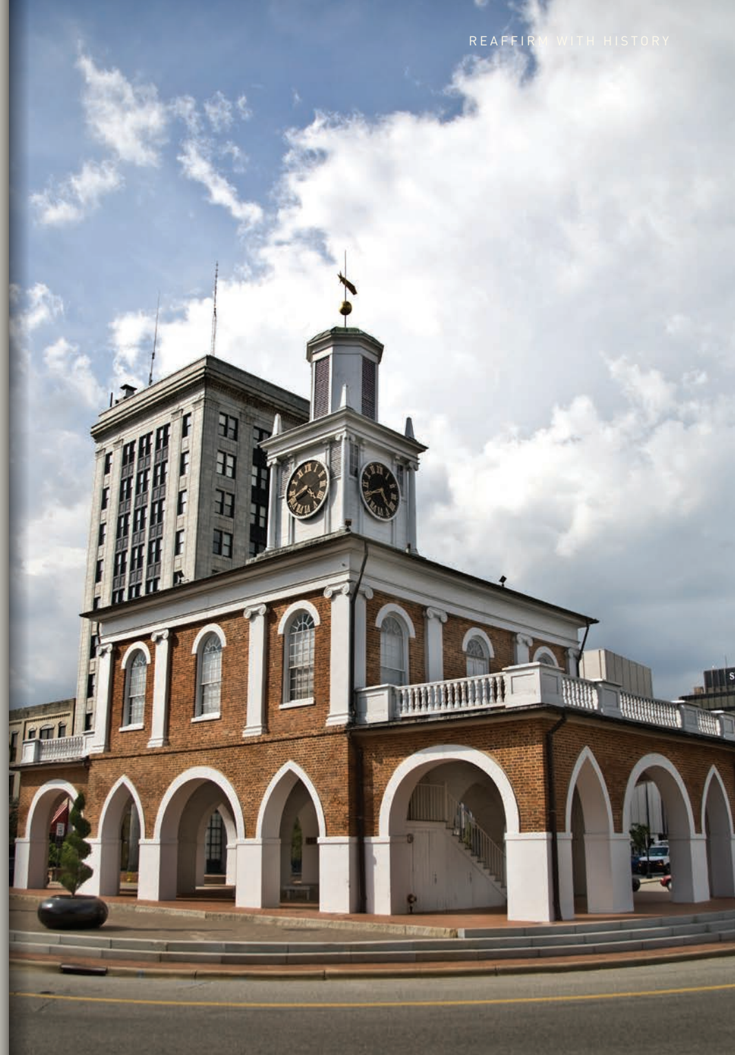
FAYETTEVILLE MARKET HOUSE