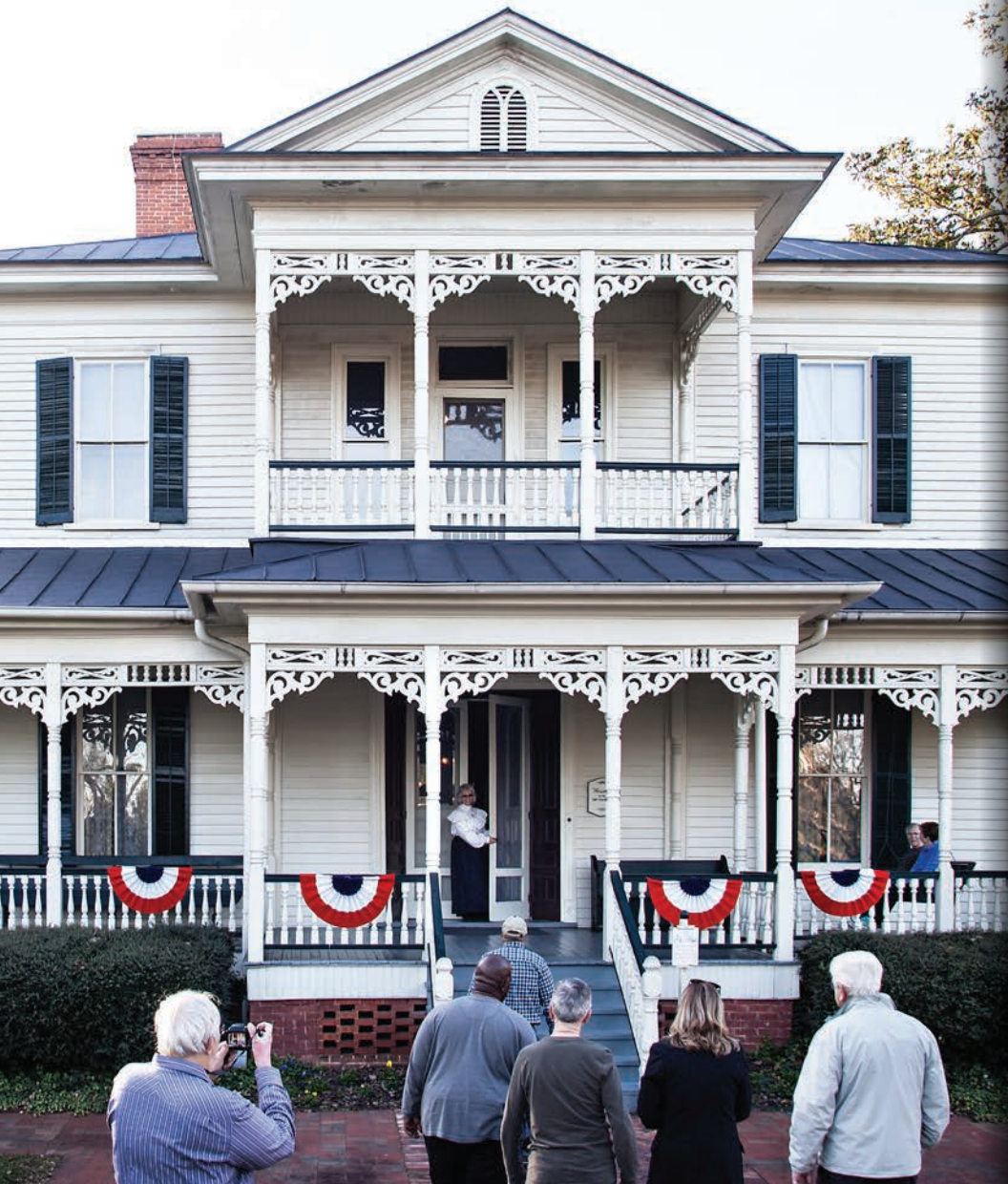
MUSEUM OF THE CAPE FEAR HISTORICAL COMPLEX: 1897 POE HOUSE