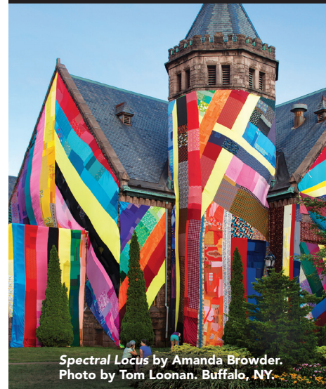
Spectral Locus by Amanda Browder. Buffalo, NY.