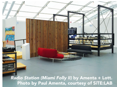
Radio Station (Miami Folly II) by Amenta + Lott.

For more details visit project.artprize.org