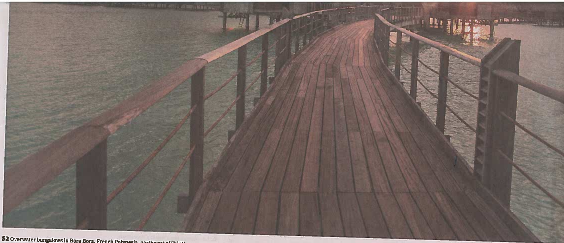
52 Overwater bungalows in Bora Bora, French Polynesia, northwest of Tahiti.