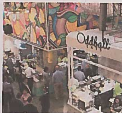
46 Finn Hall is one of four food halls that opened in Houston last year.