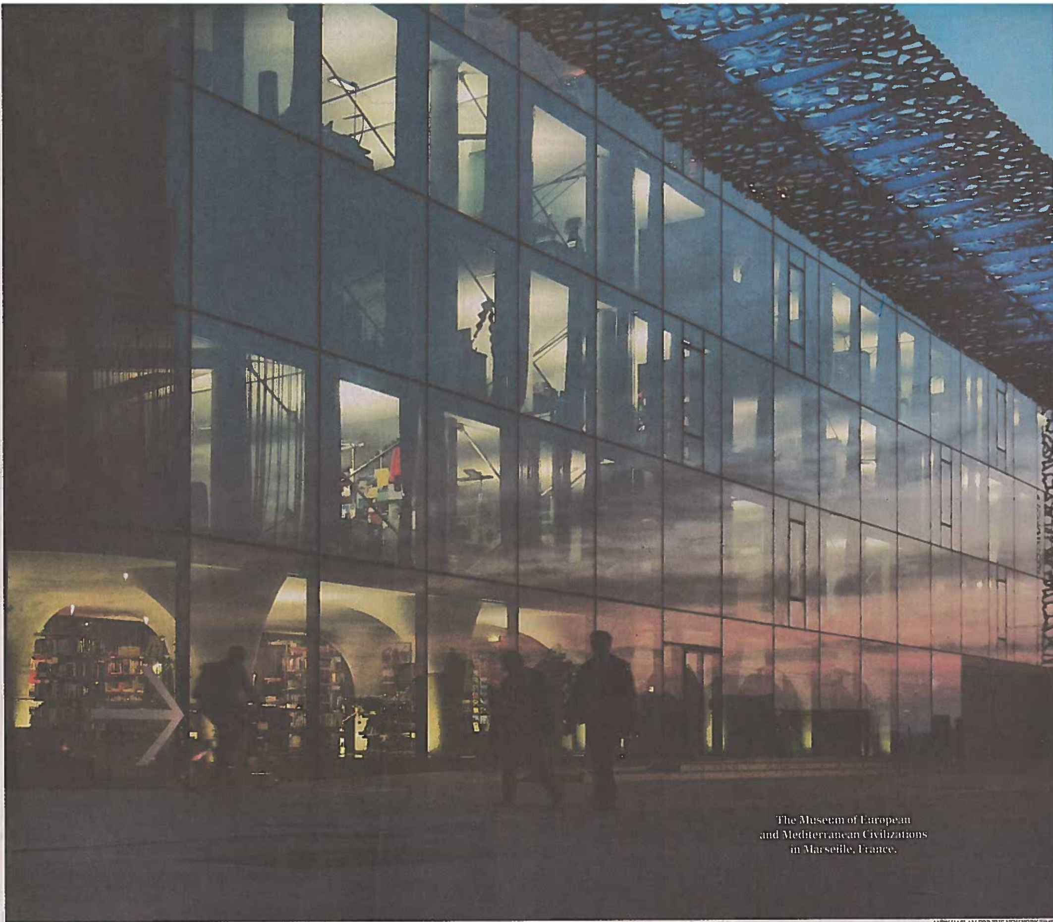
The Museum of European and Mediterranean Civilizations in Marseille, France.