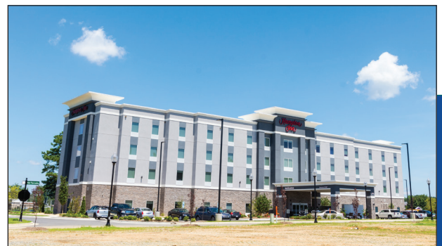
The new dog-friendly Hampton Inn Benson opened in June, 2018, next to the Dog Park.

Revenues not expended on behalf of each town are held in Fund Balance Reserves for future marketing or tourism-related projects approved by each town.