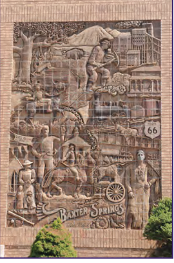
Frieze depicting Baxter Springs heritage

the original Route 66 roadbed as it curves its way out of town toward the Oklahoma State Line, but not before you "get your kicks" enjoying the many one-of-a-kind places you can only find along the Kansas Route 66 Historic Byway.