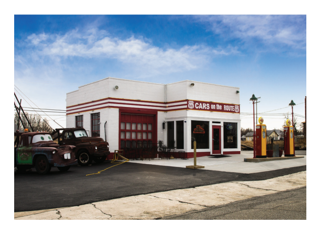
"Cars on the Route," Galena Home of "Tow Tater" the inspiration for Tow Mater in the Pixar movie "Cars"