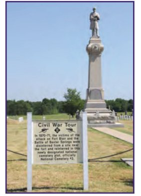
Baxter Springs City Cemetery Soldiers' Lot

the earlier battles of the Civil War, an attack on the fort by Quantrill's Raiders in 1863. Many of the casualties of that battle were buried at the Baxter Springs City Cemetery Soldiers' Lot, a Civil War Era National Cemetery, found a mile west of town. Southeast of the fort site is the Baxter Springs Heritage Center and Museum with exhibits preserving and