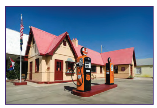
Visitor Center in Baxter Springs

adventure. Cruising on south through downtown, many of the buildings retain their original store-fronts. There are murals that depict some of the area's history, including the early cow town days or buildings such as the 1870 Crowell bank building that was said to have been robbed in 1876 by Jesse James and Cole Younger.