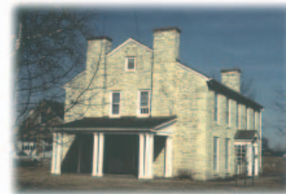
Kaw Mission State Historic Site, Council Grove

The byway takes you on a journey into the history of the American West. Council Grove was named in 1825 by U.S. Commissioners surveying the Santa Fe Trail and seeking safe passage from tribes along the trade route. Look for the trunk of the Council Oak where an agreement was signed with Osage chiefs.