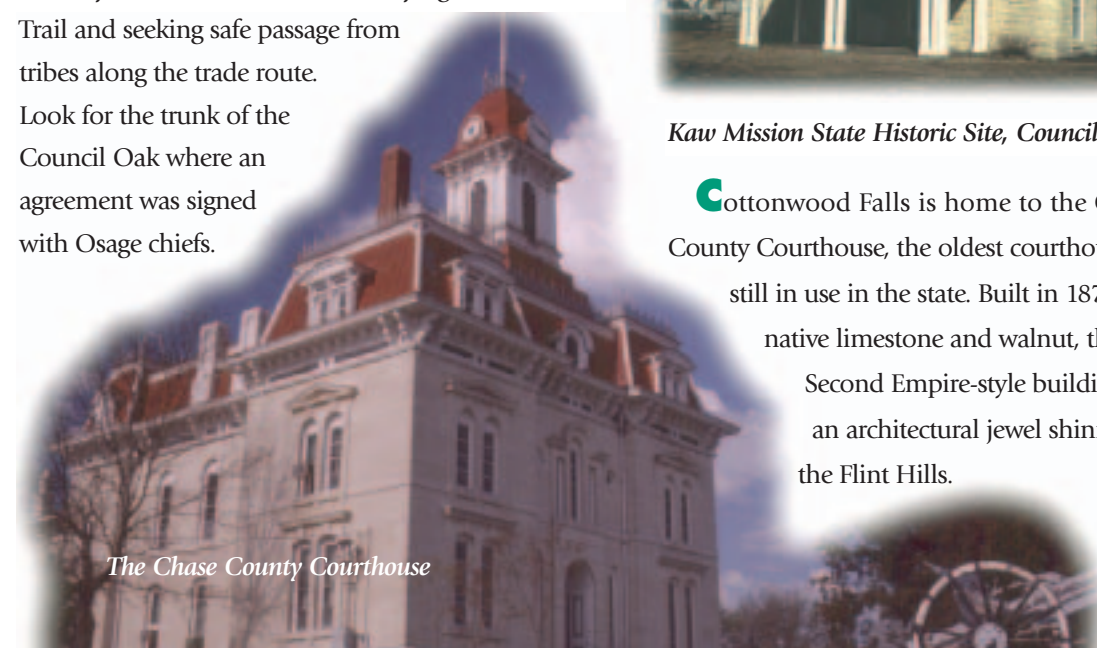
The Chase County Courthouse

Cottonwood Falls is home to the Chase County Courthouse, the oldest courthouse still in use in the state. Built in 1873 with native limestone and walnut, this Second Empire-style building is an architectural jewel shining in the Flint Hills.