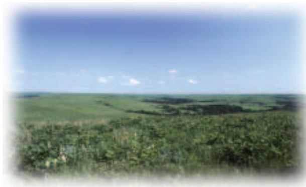
The endless sky over a sea of prairie grasses

Two miles north of Strong City, the Tallgrass Prairie National Preserve protects a portion of pristine prairie. This fragile ecosystem is home to 40 species of grasses, 200 species of birds, 30 mammals, plus reptiles, amphibians and as many as 10 million insects per acre. Look for swooping red-tailed hawks, cotton-tailed rabbits, elusive foxes, coyotes, and the occasional massasauga rattlesnake.