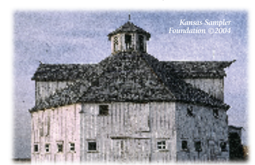
Historic Barn in Doniphan County

In their wake, the receding glaciers left some of the most beautiful landscape in the state, and some of the most fertile farmland. The area's access to rivers and its fertile soil drew settlers who built communities such as Atchison, Leavenworth, Troy and White Cloud.