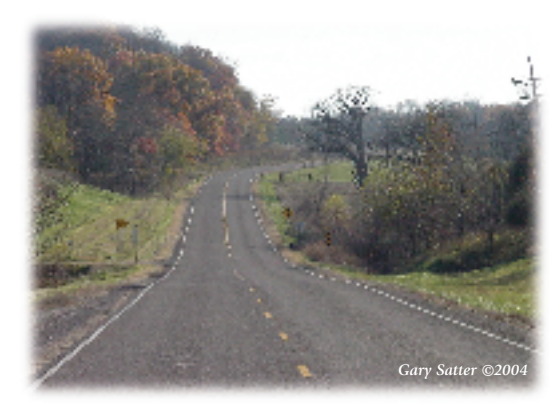
A scenic road along the Glacial Hills Byway

"We passed a Creek...this Creek has no name, and this being the 4<sup>th</sup> of July the day of the independence of the US, call it 4<sup>th</sup> of July 1804 Creek. We came to another Creek...which we called Independence Creek, in honor of the day."