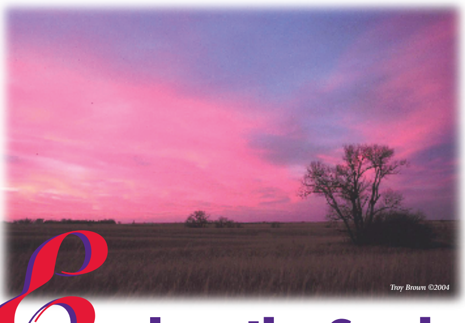
A view of the bluffs from Cedar Bluffs Reservoir