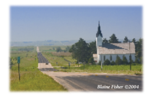
Zion Lutheran Church

Whether your preference is enjoying the natural beauty of wildflowers, the picturesque vista of windmills, the beauty of limestone bluffs or the wonders of the past, we welcome you and hope you will visit us again.