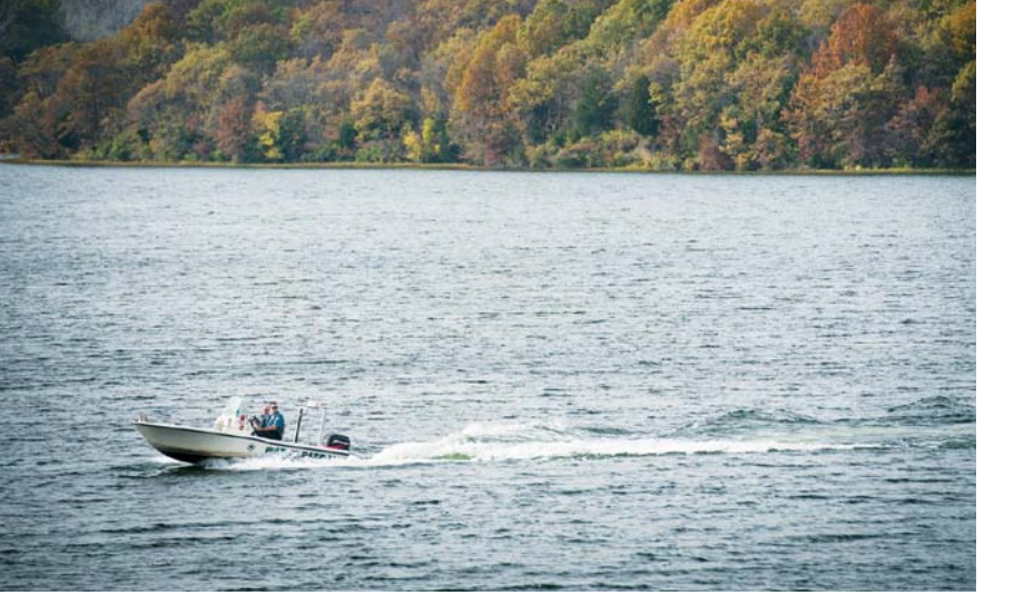
Let the kids roam free on the largest playground in Kansas City, KS, at Wyandotte County Lake — Pack a picnic, see wildlife up close and personal, catch a fish, or make some waves on a boat ride. Checklist No. 56