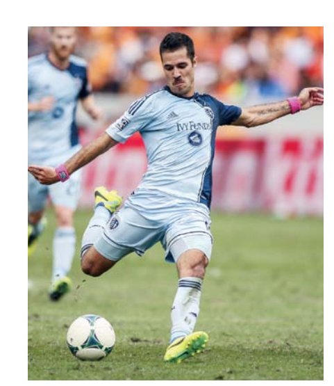
Kick it with the 2013 MLS Champs Sporting Kansas City at Sporting Park — This stateof-the-art stadium was built with fans in mind. Checklist No. 24