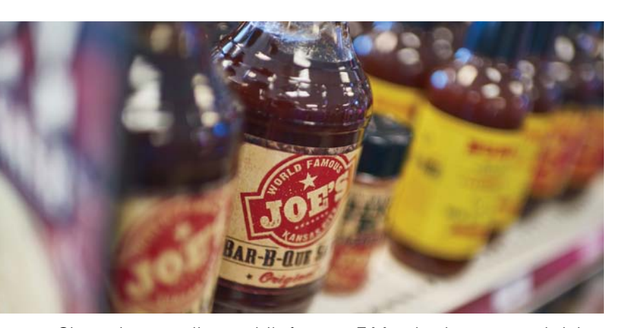
Chow down on the world's famous Z-Man barbecue sandwich at Joe's Kansas City Bar-B-Que — This nationally recognized barbecue joint has been featured on TV and is frequently visited by celebrities. Checklist No. 71