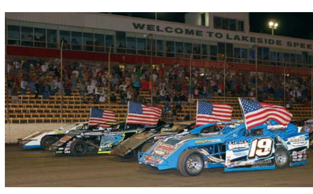
Ramp up your Friday nights at Lakeside Speedway — Enjoy heartpounding excitement as you watch racing on a half-mile dirt track or put yourself in the driver's seat at the Kenny Wallace Dirt Racing Experience. Checklist No. 48