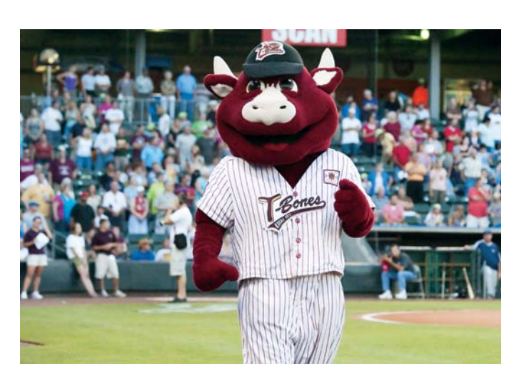
Get your sizzle on with Sizzle at a Kansas City T-Bones game — Enjoy dollar hot dogs, the children's play area and good old-fashioned baseball. Checklist No. 16