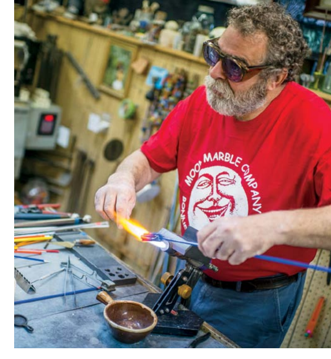
Play old-time marble games at Moon Marble Company — Watch a live marble-making demonstration and delight in the timeless toys and games. Checklist No. 79

Enjoy a movie under the stars at Boulevard Drive-In — Experience the world's first 4K drive-in digital cinema projection system, double feature specials and snack bar goodies. Checklist No. 64