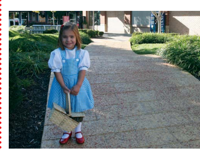
Skip down the yellow brick road at Legends Outlets Kansas City — Find bargains, unique eateries and live entertainment all summer long. Checklist No. 40