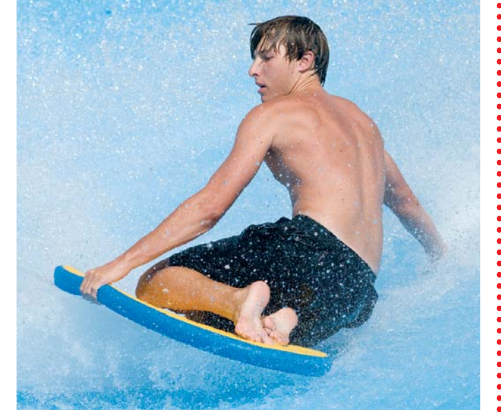
Plunge down the world's tallest waterside Verrückt at Schlitterbahn Kansas City Waterpark — Schlitterbahn is also home to the Boogie Bahn surf ride and other fun attractions. Checklist No. 8