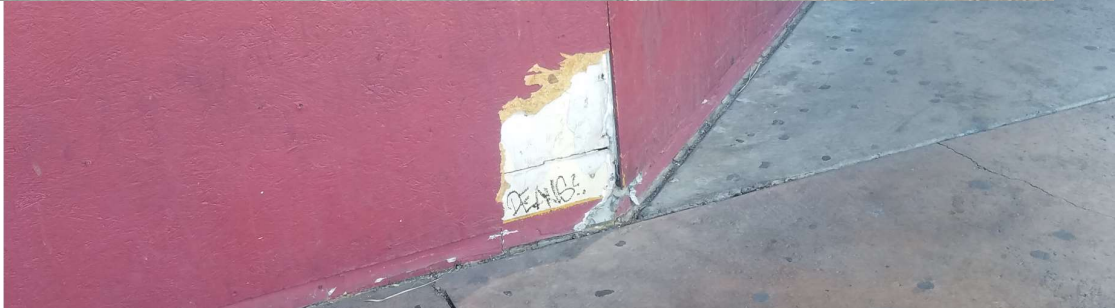
South Side Neonopolis