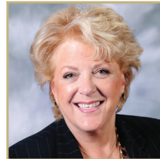
CAROLYN G. GOODMAN Mayor City of Las Vegas