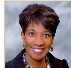
PAMELA GOYNES- BROWN Councilwoman City of North Las Vegas