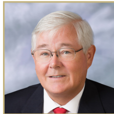
KIERNAN MCMANUS Mayor City of Boulder City