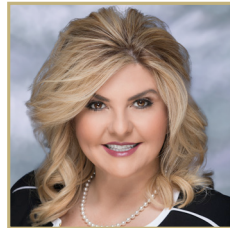
MICHELE FIORE Councilwoman City of Las Vegas