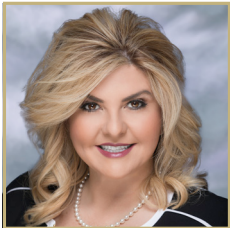
MICHELE FIORE Councilwoman City of Las Vegas