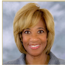
PAMELA GOYNES- BROWN Councilwoman City of North Las Vegas