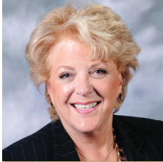
CAROLYN G. GOODMAN Mayor City of Las Vegas