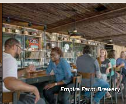
Empire Farm Brewery