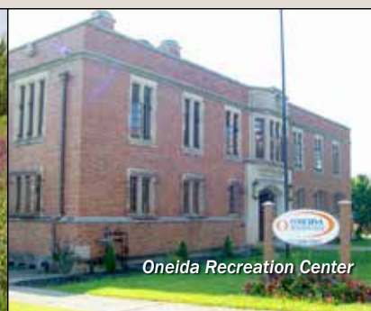
Oneida Recreation Center