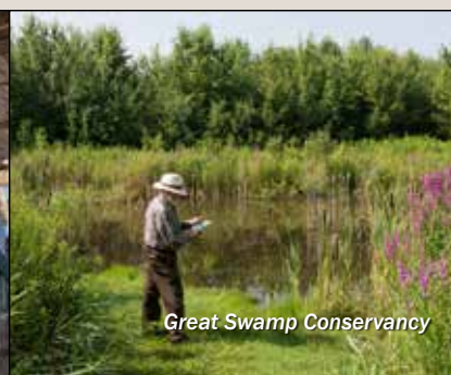
Great Swamp Conservancy