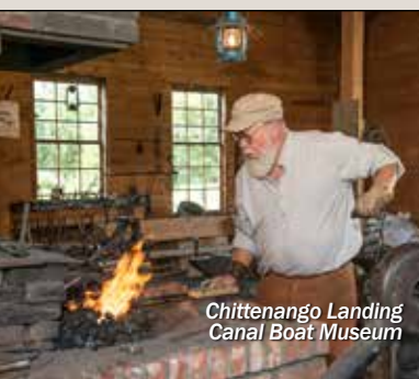
Chittenango Landing Canal Boat Museum

From farm-sourced food and craft beverages to shopping, outdoor activities, museums, history, and more, take some time to unwind, explore, and enjoy the riches of Madison County.