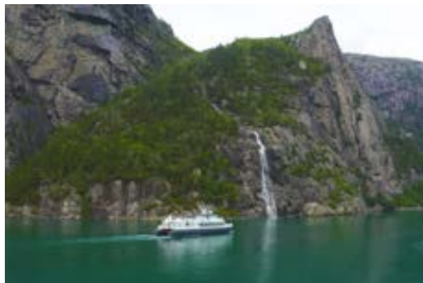
The Lysefjord