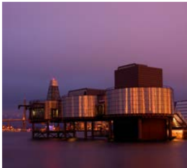
The Norwegian Petroleum Museum

From oil to oil full circle! The tour starts with a walk through Old Stavanger with its 173 wooden houses, all under preservation order.