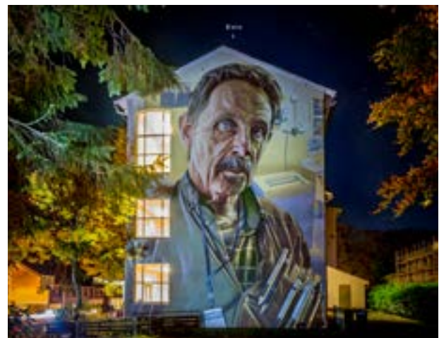
Street art by artist SMUG