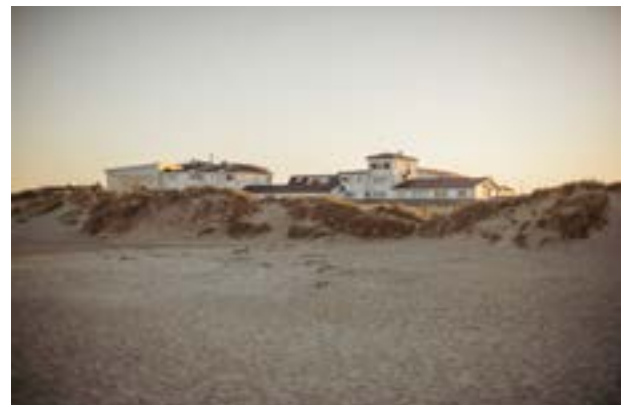
Sola Strand Hotel