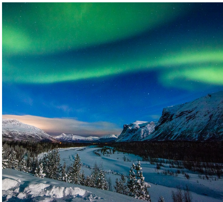
NorthernLights - Reisavalley ©Matt Harris - Reisastua Lodge