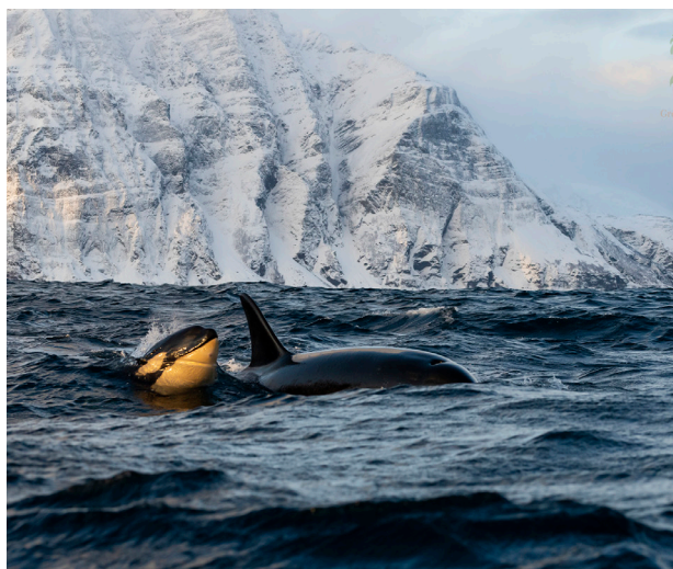
Orca whale watching in Northern Troms