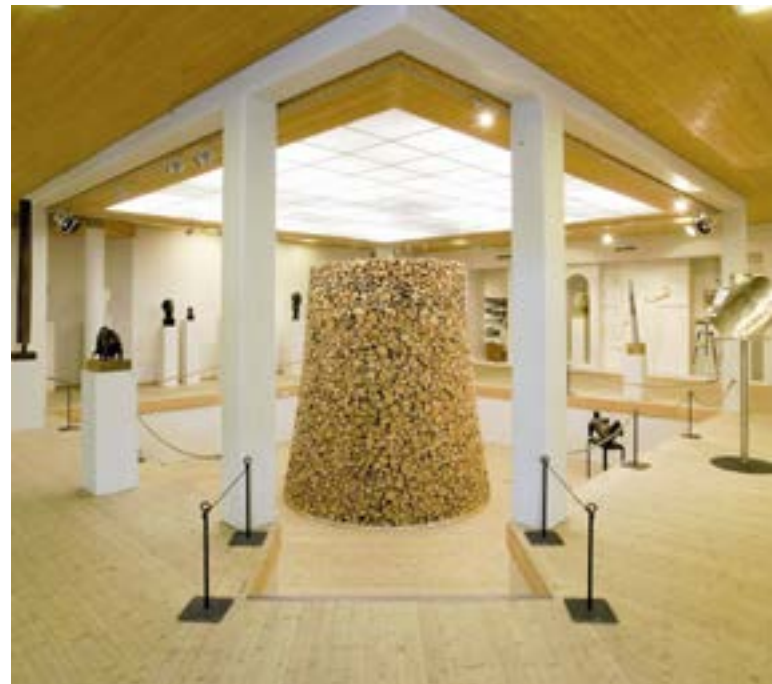
Nils Aas Art Workshop- Inderøy