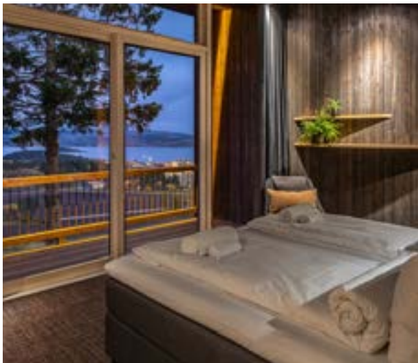
ØYNA hotell Inderøy