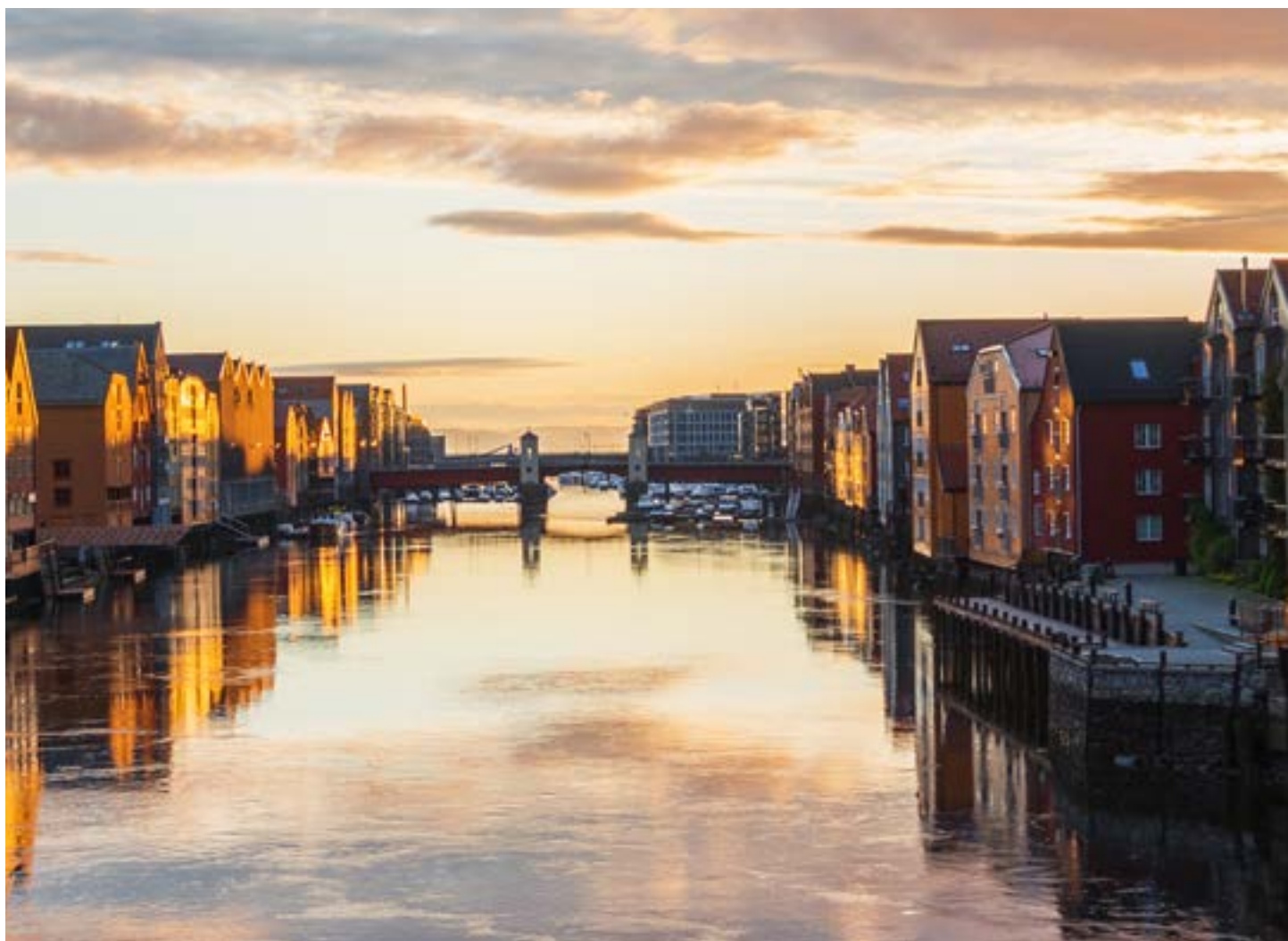
Bryggerekkja Trondheim