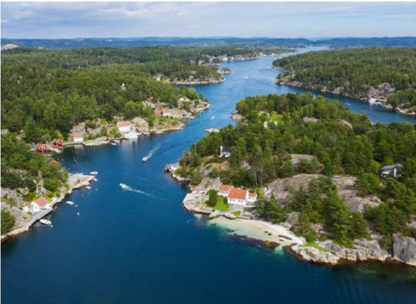
Southern Norway - overview of Blindleia-Magnus Furset _ visitnorway.com