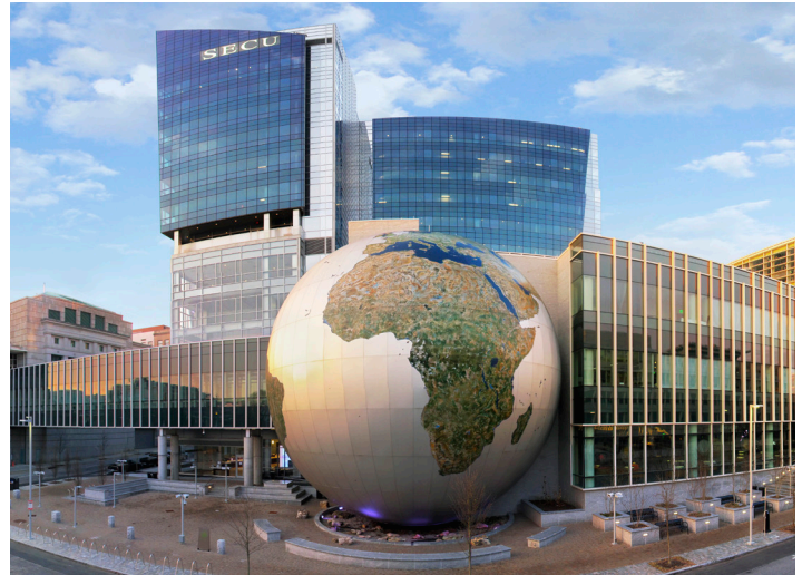
Nature Research Center

Lastly the City should continue to work with GRCVB marketing efforts to drive visitation to the entire county and utilize the existing calendar of events and website database tools. It could also work within the countywide materials to market its Quality of Place amenities separately to travelers.