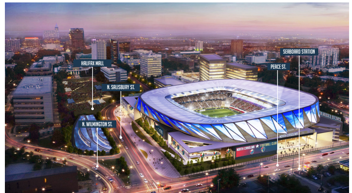
Potential redevelopment of Raleigh’s government campus

The GRCVB’s collection of Passionate Minds includes the retailers of Stitch (Holly Aiken) and DECO Raleigh (Pam Blondin). These local makers have created a vibrant, locally driven shopping experience in the city. These offerings