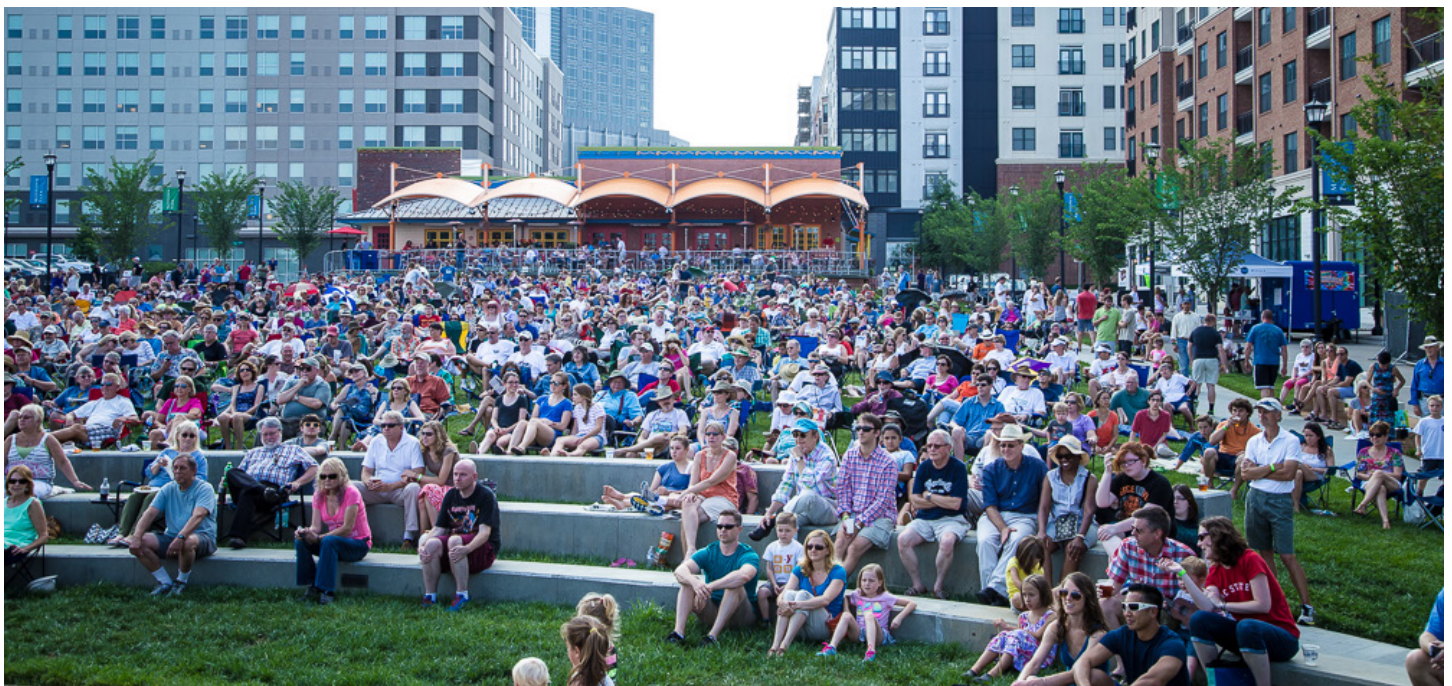
Events at North Hills