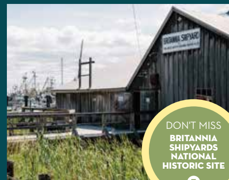
DON'T MISS BRITANNIA SHIPYARDS NATIONAL HISTORIC SITE