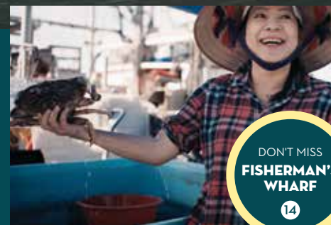
DON'T MISS FISHERMAN'S WHARF

Back in the car, explore the rest of Richmond. The landmark Richmond Olympic Oval ⑲ —speed skating venue at the 2010 Winter Olympics—houses cool sports simulators in Canada’s only official Olympic museum ⑳ (1 hour).