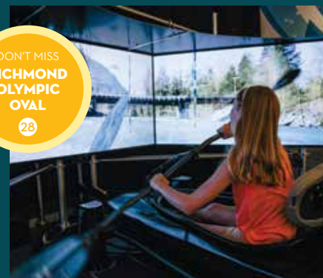
DON'T MISS RICHMOND OLYMPIC OVAL