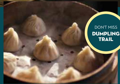
DON'T MISS DUMPLING TRAIL

If picking your own produce seems like hard work, hit the popular farm store at Richmond Country Farms ④ instead—depending on the season, you can even buy fresh cranberries from local cranberry bogs here (30 minutes). f