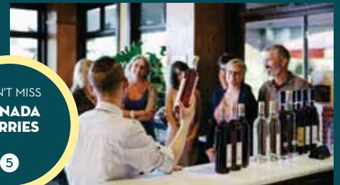
DON'T MISS CANADA BERRIES 5