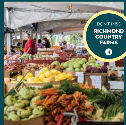
DON'T MISS RICHMOND COUNTRY FARMS 4