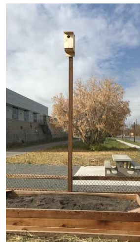
Home Sweet Bird Home