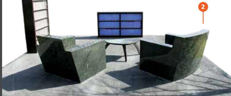
LIGHT READING Peter Reiquam. 2006. This work of "outdoor furniture" functions both as a seating area and a beautiful aesthetic object. Commissioned by the Washington State Arts Commission in partnership with Washington State University — Spokane, Light Reading is located at the southwest corner of the WSU Academic Building. ✕ 2