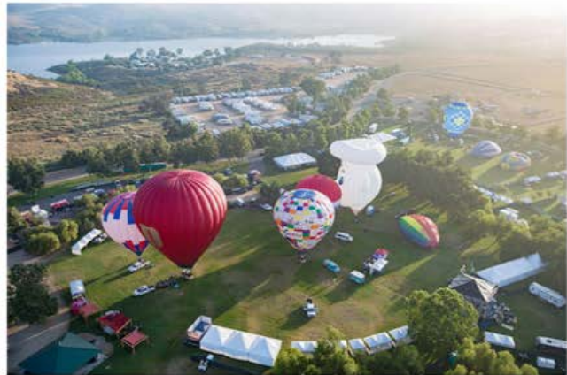
David Knighton/Getty Images