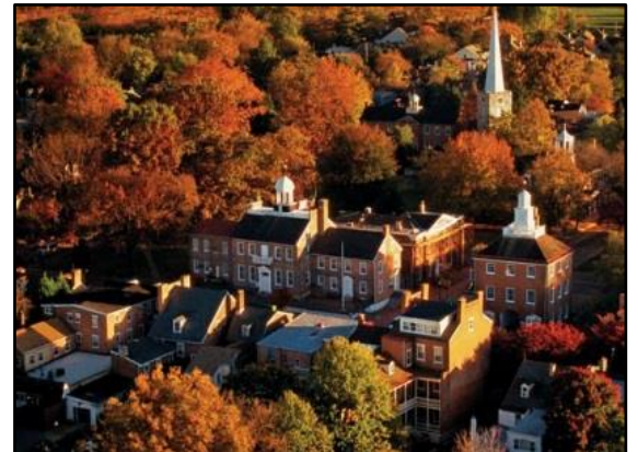
The Tubman Byway winds through Olde New Castle, Del., site of the fugitive slave trials that informed the layout of Delaware's 'Tubman Byway.'

In a single 'Tubman Byway' trip, the Byway's landmarks and scenic vistas bring history alive, while the route's quaint shops, restaurants and attractions greet visitors with special 'Byway Buck' offers and the hospitality of a bygone era.