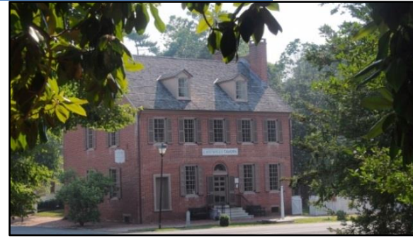
Redeem your 'Byway Buck' at historic Odessa, Del's iconic Cantwell's Tavern. Cantwell's has been a hotel and tavern since 1822.