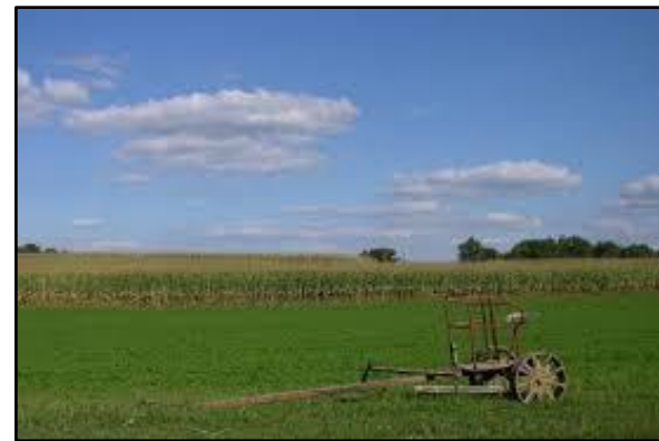
Delaware's scenic farmland was the backdrop to some of the state's most storied Underground Railroad activity.