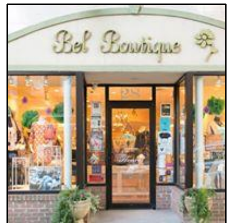
Byway Buck business Bel Boutique is a trend-setting shop that has fast become a cornerstone of the leafy, nostalgic Loockerman Street commercial corridor in downtown Dover, Del.